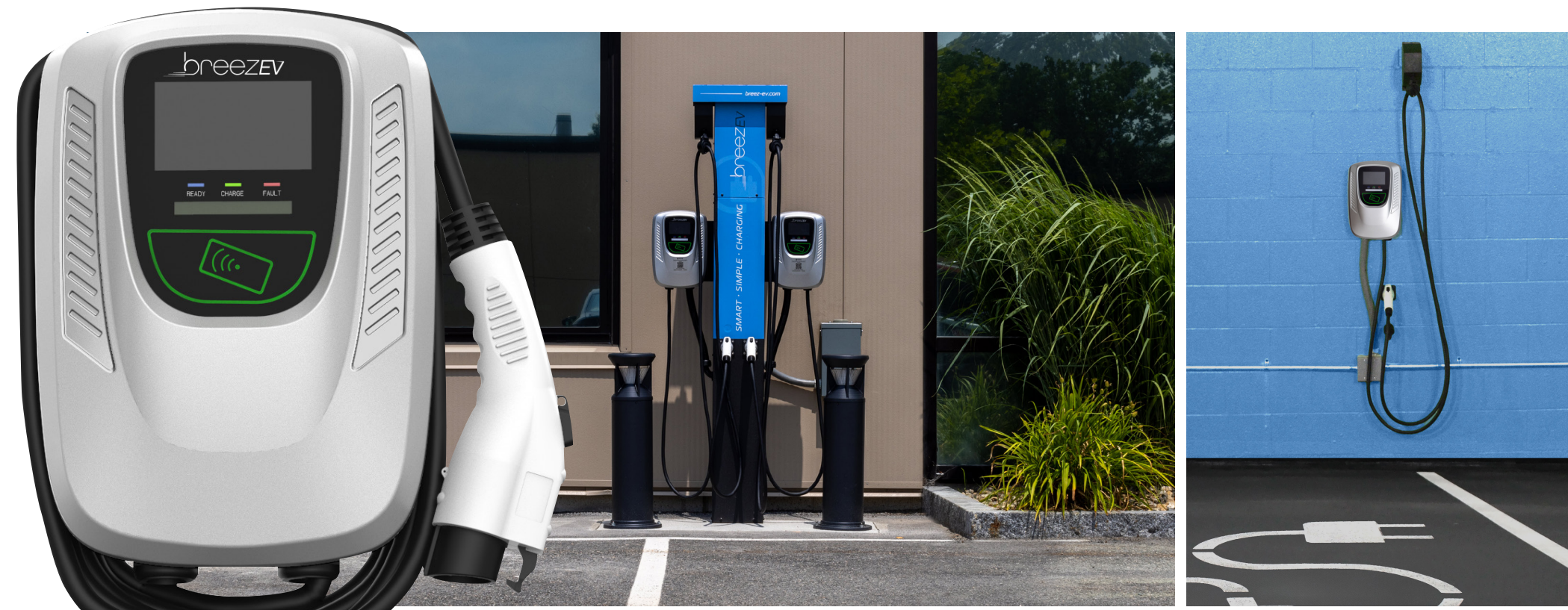
← P48 / P80

SMART LEVEL 2, ELECTRIC VEHICLE CHARGERS EQUIPPED W/ LCD SCREEN, RFID, OCPP NETWORKED. Up to 80A charging power along with built-in ampUp software. Pedestals and mounting options are all made in the USA, and can be custom branded to match your needs.