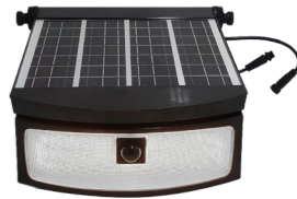
DETACHABLE SOLAR PANEL W/ 6FT CABLE