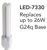
LED-7330 Replaces up to 26W G24q Base

**Shipped with horizontal-to-vertical adapter LED-7317-ARM. May not fit in all 6" cans; test-for-fit.