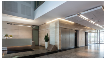
Cove & Ambient Lighting