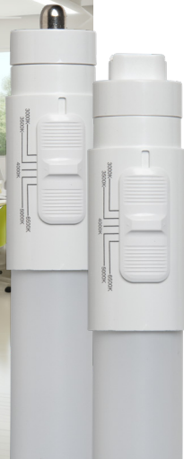
FA8 BASE R17D BASE

RETROFIT FLUORESCENT T8s W/ LONG-LASTING, ENERGY-SAVING LED T8s. High-quality Type-B tubes provide excellent light output and includes FlexColor for in-field CCT adjustability.